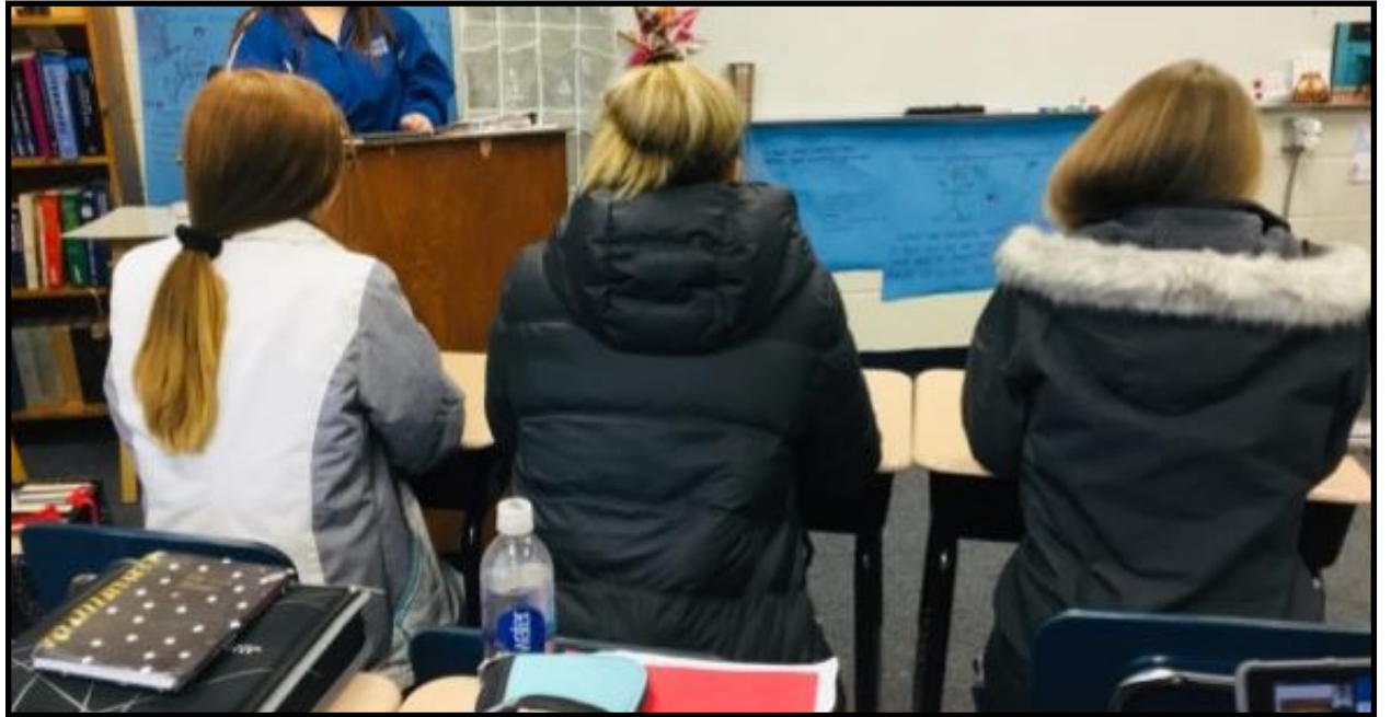
Students have struggled to find consistent temperatures in the school over the past few weeks. While some of it has been issues with the heating system itself, others variances in temperature can be attributed to the polar vortex we've experienced. To deal with this use, students have resolved to wear their coats to class, knowing it is against the dress code.

Most dress in layers and just wish that when going to